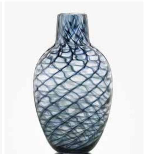
Grand Prix National Baltic Sea Glass. UNICA