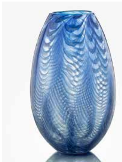
Grand Prix D'Honneur Baltic Sea Glass. UNICA