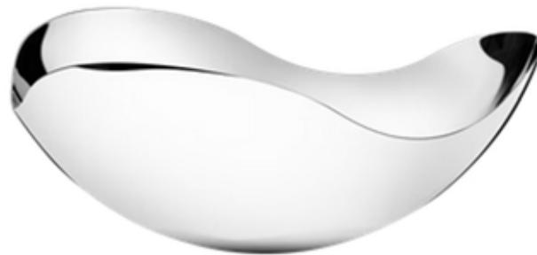
HAFNIA 24 Medal