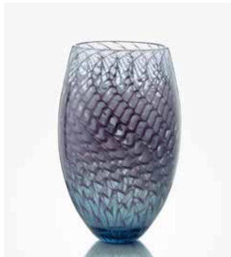
Grand Prix International Baltic Sea Glass. UNICA