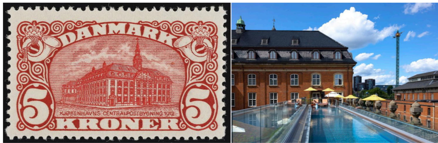
The former Copenhagen Post Office is now a hotel located 200 meters from the HAFNIA 24 venue.

If you are planning to visit HAFNIA 24, there are seven hotels within 500 meters from the venue – the list of these hotels and links to their websites can be found on www.hafnia24.com . And more than 10 additional hotels are within walking distance of the venue. The exhibition will take place in the very center of Copenhagen in the old Ox-hall "Øksnehallen" build in 1901, which today is of the most iconic exhibition hall in Copenhagen. The hall has 5000 square meters of space for the 1500 frames, dealers etc.