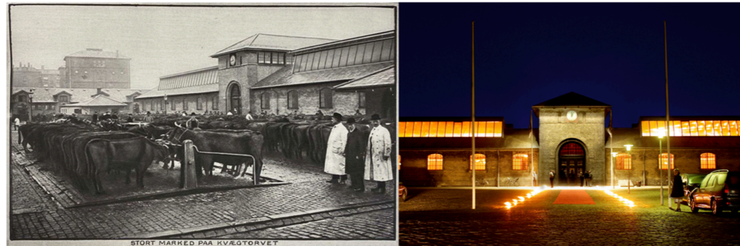
The HAFNIA 24 venue: "Øksnehallen" (The old ox-hall) then and now.

Please read more about the HAFNIA 24 Club here: https://www.hafnia24.com/hafnia-24-club/ and please apply for membership of the HAFNIA 24 Club by emailing: hafnia24club@hafnia24.com .